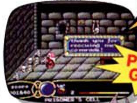
SPIKE SAVES THE DAY