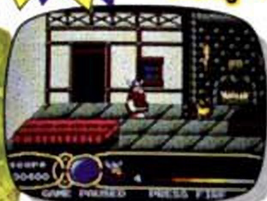
SPIKE'S SEARCH BEGINS